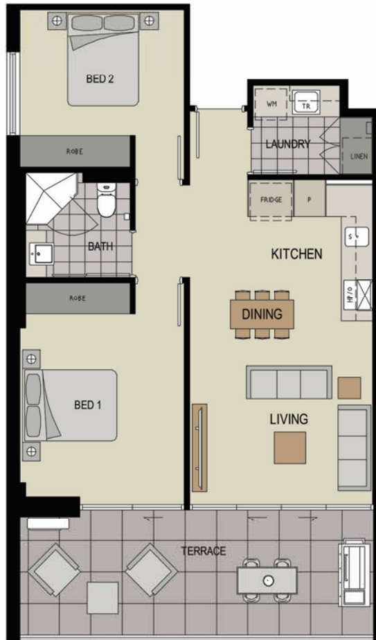
TYPE F (F2 Reversed)